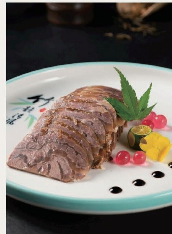
五香金錢牛腱 $13.95 Marinated Braised Beef Shank