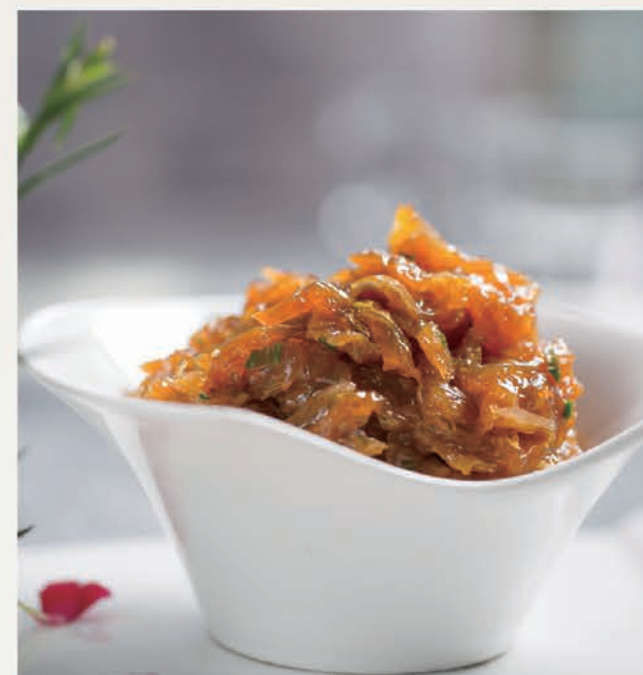
蔥油麻海蜇 $13.95 Cold Jellyfish